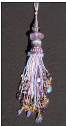
Liz's Beaded Tassel