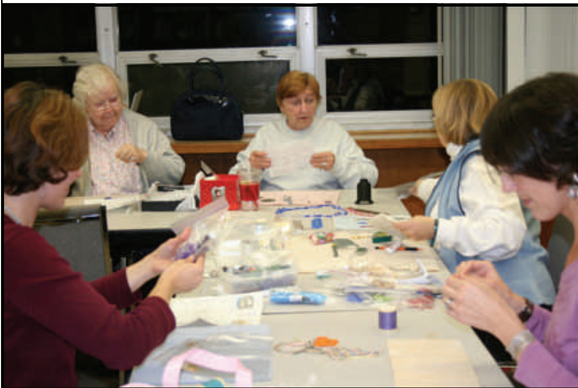
Lattice Cube Bracelet —