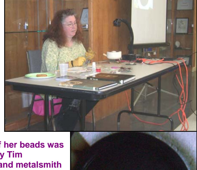
This picture on screen above.