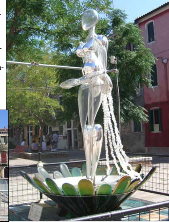
If you would like to view more mosaic glass pieces yourself please check these websites. <a href="http://en.murano-glass-shop.it/">http://en.murano-glass-shop.it/</a>, <a href="http://en.murano-glass-shop.it/">www.muranochandeliers.com</a>, <a href="http://en.murano-glass-shop.it/">-Johanna Stange</a>